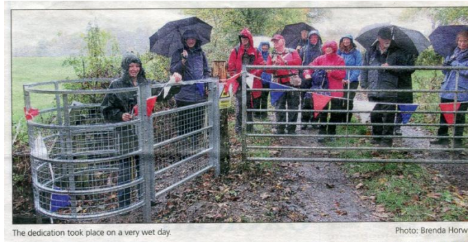
The dedication took place on a very wet day.